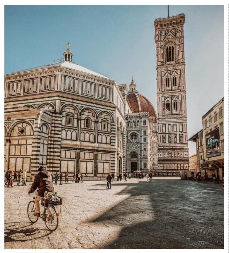
Small Group Travel rewards travelers with new perspectives. With just 12-24 passengers, these are the personal adventures that today's cultural explorers dream of.

11 Days • 15 Meals: 9 Breakfasts, 3 Lunches, 3 Dinners